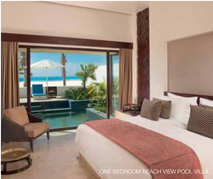
ONE BEDROOM BEACH VIEW POOL VILLA