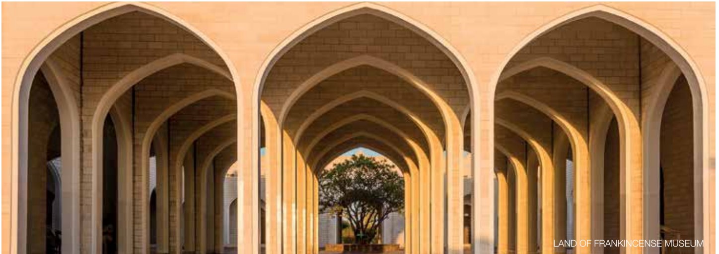
LAND OF FRANKINCENSE MUSEUM